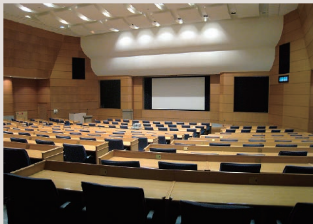
Large conference hall