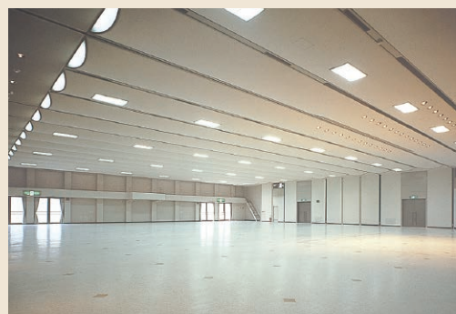
Large hall: Pulse