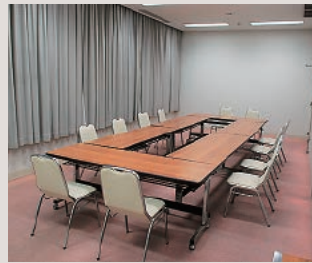
Meeting room 1