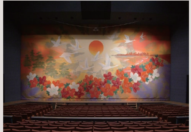
Large hall "Euphony Hall"