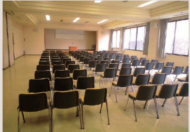
Large meeting room